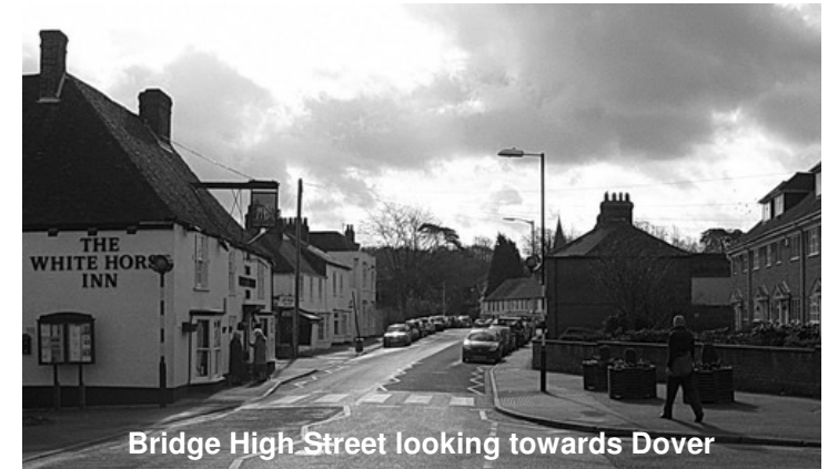
Bridge High Street looking towards Dover